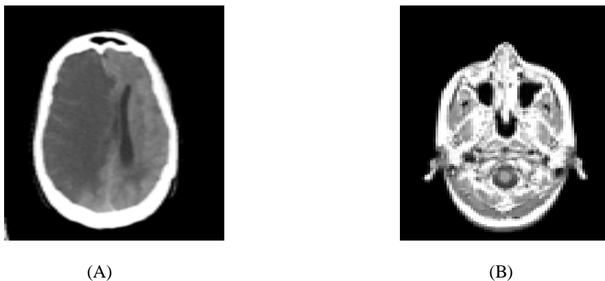
Fig.2: (A) Input Image (human brain) (B) Fusion Image

In this Method, Image fusion framework is proposed for multimodal medical images. In fusion, two different rules are used for getting more information from the fused image. The low frequency bands are fused by considering phase congruency where as directive contrast is adopted as the fusion measurement for high frequency bands.